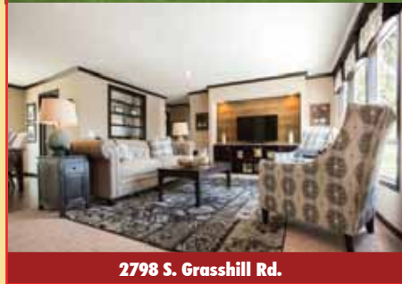
2798 S. Grasshill Rd.

NEW-2016 SOUTHERN ENERGY PATRIOT 56' X 28' 3BR/2BA, Full Drywall, 72" Walk-in Shower, Upgraded insulation, Granite Island, Wood Cabinet Fronts, Stoneskirting, Approximately 1,500 sq ft. ... $74,400.