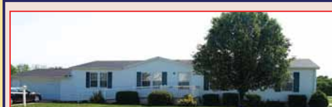
2887 S. Grasshill Rd .

2007 SKYLINE HOME Excellent condition. Wood kitchen cabinets, hidden walk in pantry. Laminated hardwood in kitchen & dining area. Spacious with covered deck & fenced back yard.. thermo pane windows, oversized garage, storm shelter & lots of storage space. Screened in rear porch. Great house for the money ... 74,900.